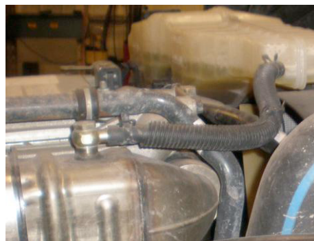
Vent line from top of the EGR cooler