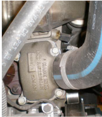
Top radiator hose connection and location of the coolant temperature sensor