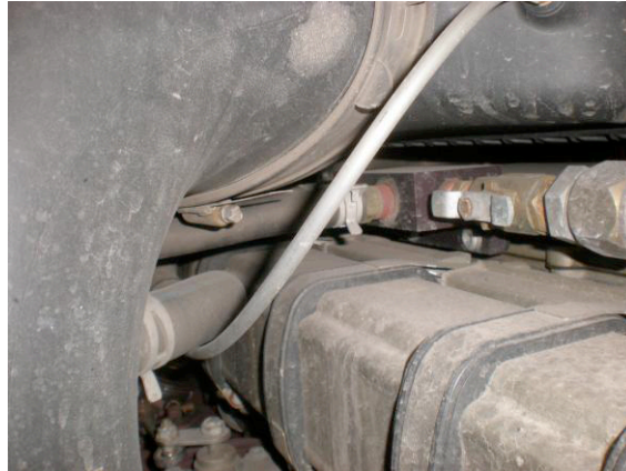
The square block is the collection manifold