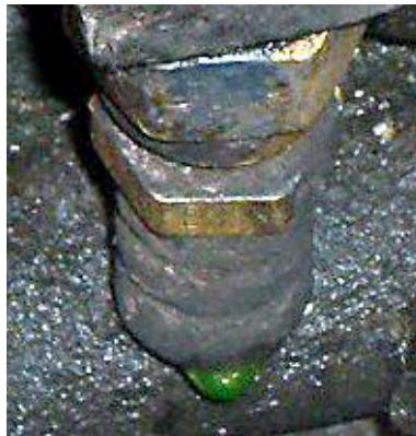
The block and compressor drains look like this